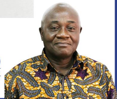
Hon. Dan Botwe (MP) MINISTER FOR LOCAL GOVERNMENT DECENTRALISATION AND RURAL DEVELOPMENT