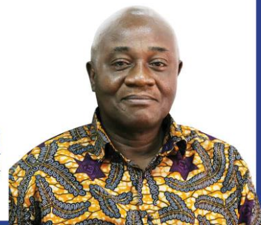
Hon. Dan Botwe (MP) MINISTER FOR LOCAL GOVERNMENT DECENTRALISATION AND RURAL DEVELOPMENT