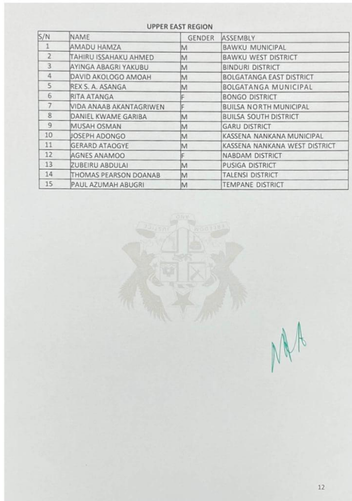
Hon. Dan Botwe (MP) MINISTER FOR LOCAL GOVERNMENT DECENTRALISATION AND RURAL DEVELOPMENT